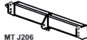
MT J206 Joint bar MITUS 212FSA with 206LA