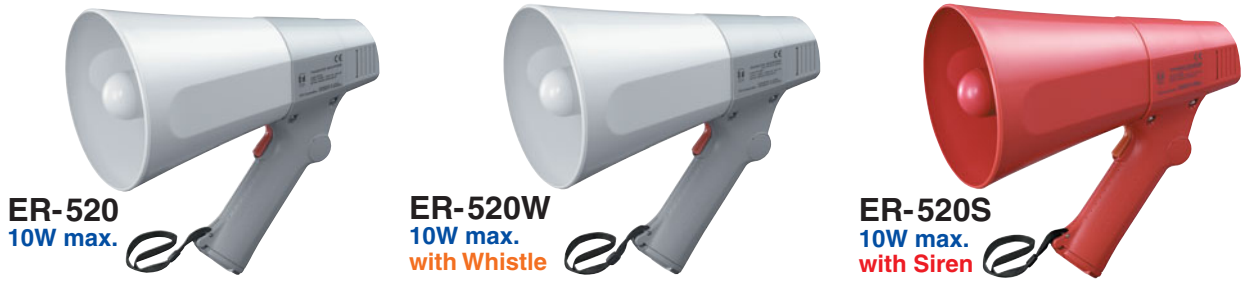
ER-520 10W max.