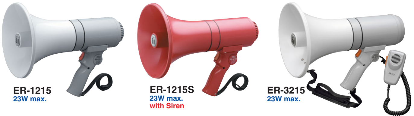
ER-1215 23W max.