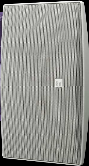
BS-634 /634T/ 1034

Unparalleled ease and simplicity of installation, with simultaneous wiring and mounting capability, then just putting in the speaker unit.